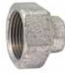
KTB100 Internal thread

ESBE connection kits for valves with external thread. One package / port.