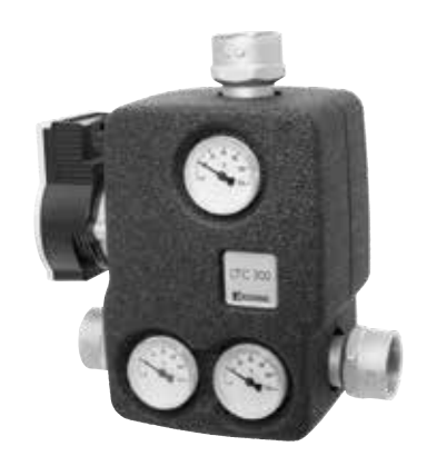
Solid fuel products SERIES LTC300