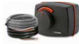
3-point, auxiliary switch