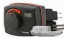
CRC141 230 V AC

Thanks to the special interface between the controller series CRC140 and the ESBE series VRG, VRH and VRB, the unit as a whole has a unique stability and precision when regulating.